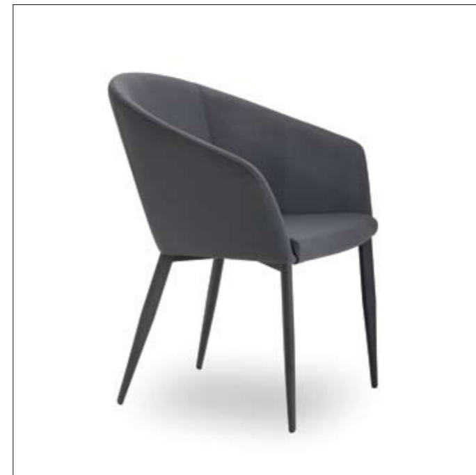
J1612 Dining chair