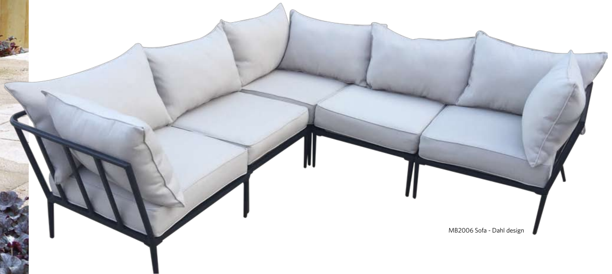
MB2006 Sofa - Dahl design