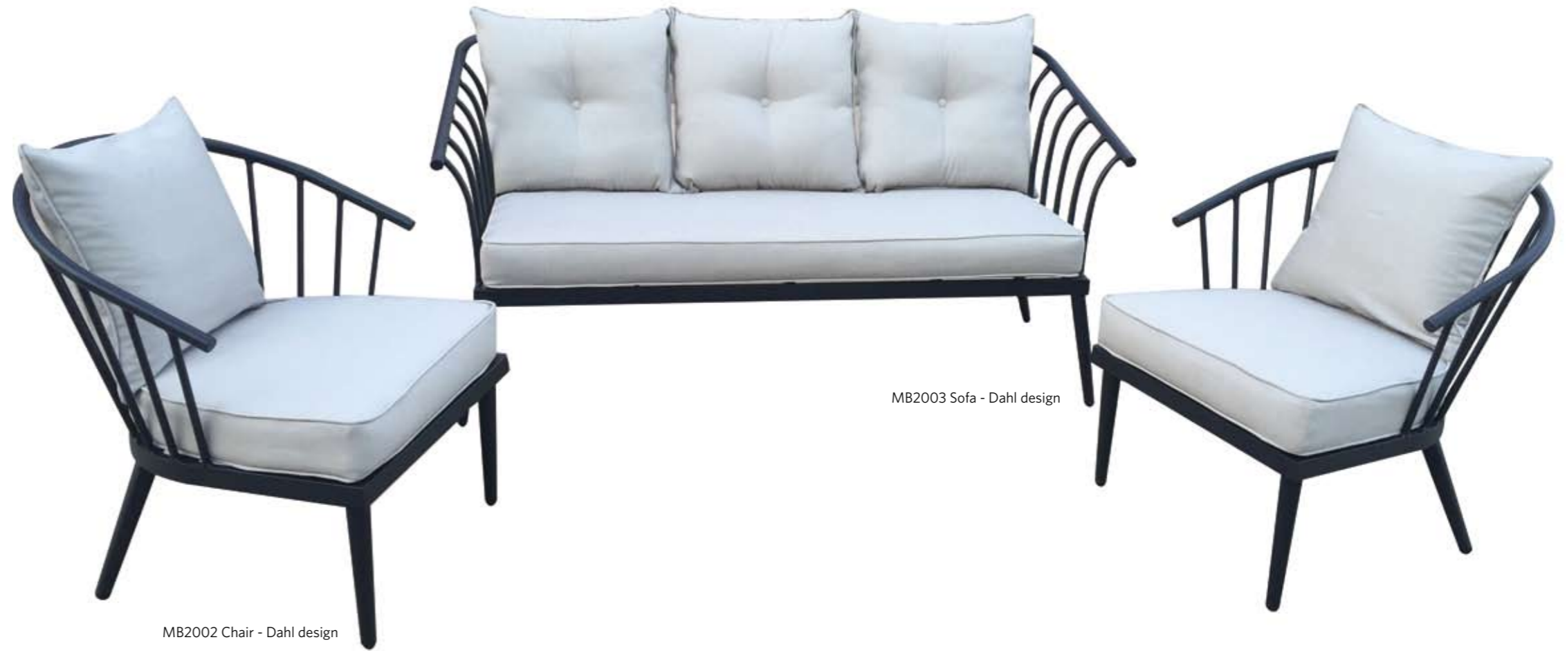
MB2003 Sofa - Dahl design