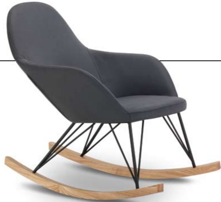
J1545-1 Rocking chair - Dahl design