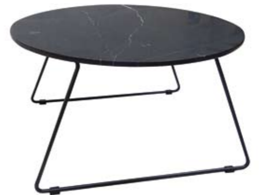
J1706 A Side table