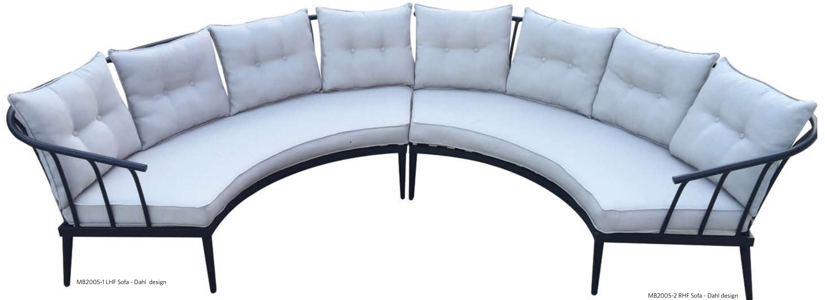
MB2005-1 LHF Sofa - Dahl design