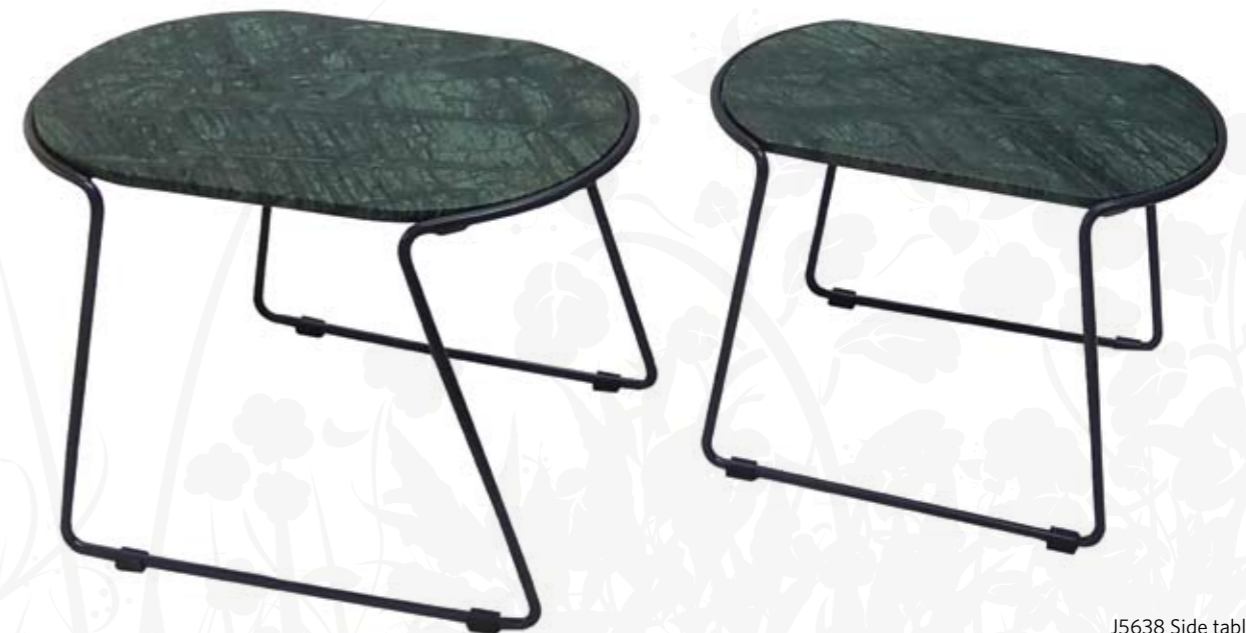
J5638 Side tables