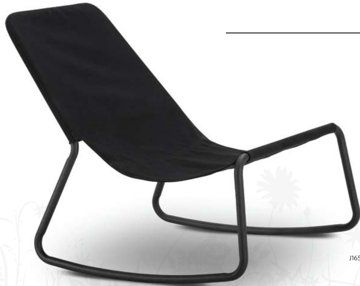
J1653 Leisure chair