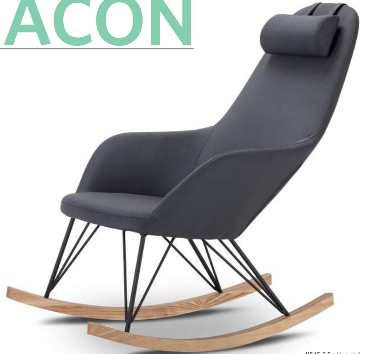
J1545-2 Rocking chair - Dahl design