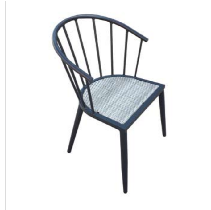
MB2001 Single chair