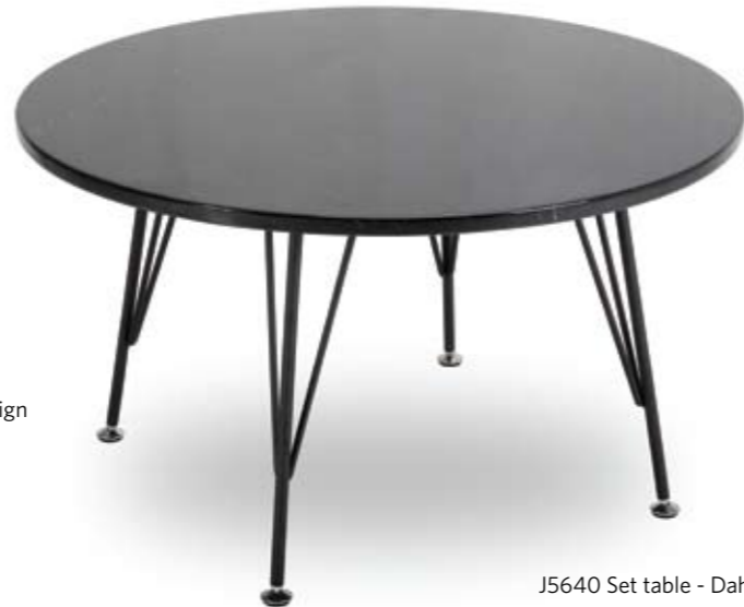
J5640 Set table - Dahl design