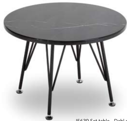
J5639 Set table - Dahl design