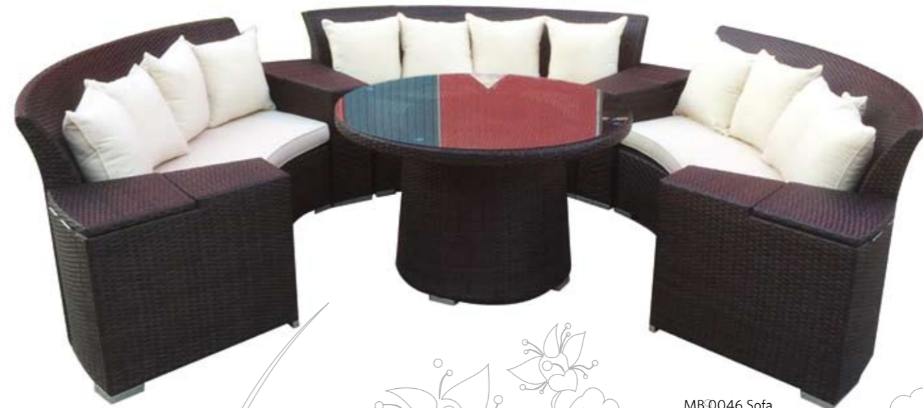
MB 0046 Sofa