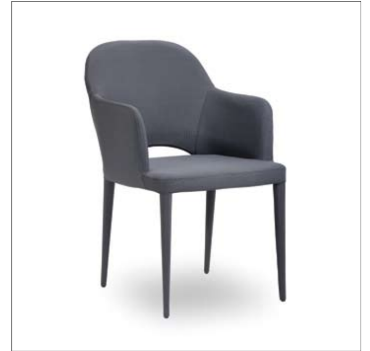
J1527 Dining chair