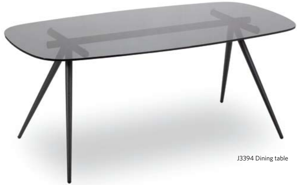
J3394 Dining table