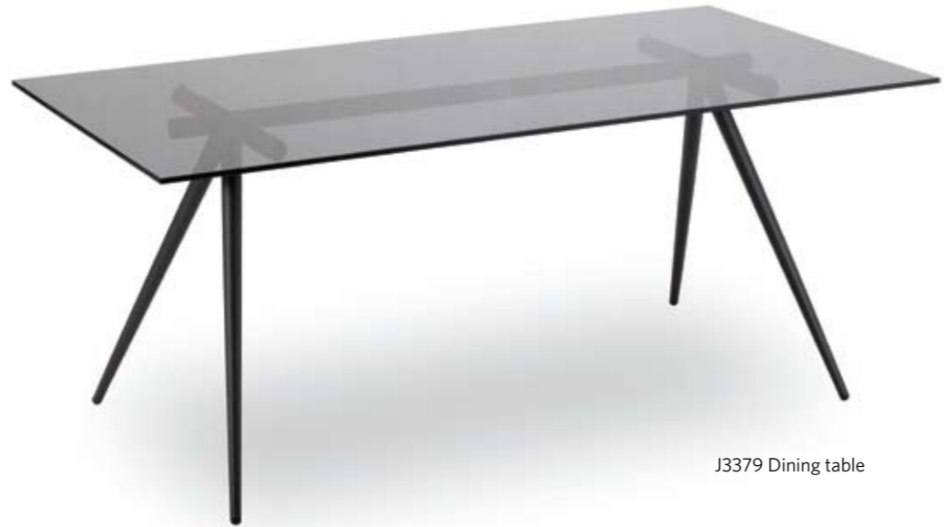
J3379 Dining table