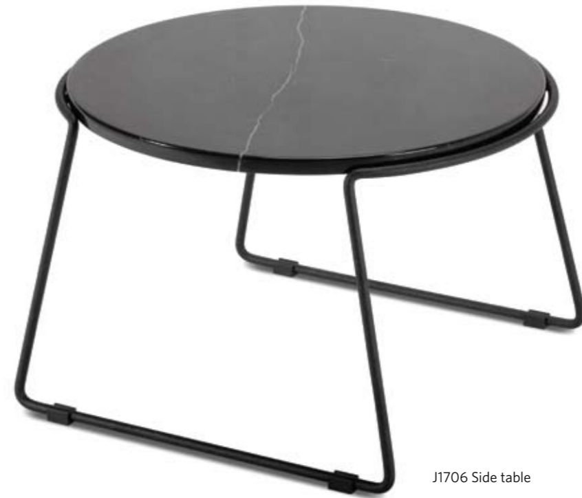
J1706 Side table