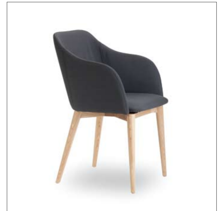
J1637 Dining chair