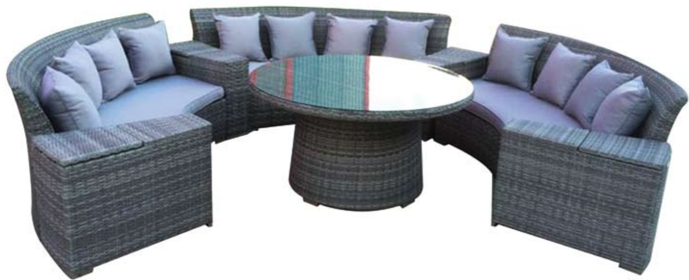
MB 6688 Sofa