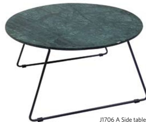
J1706 A Side table